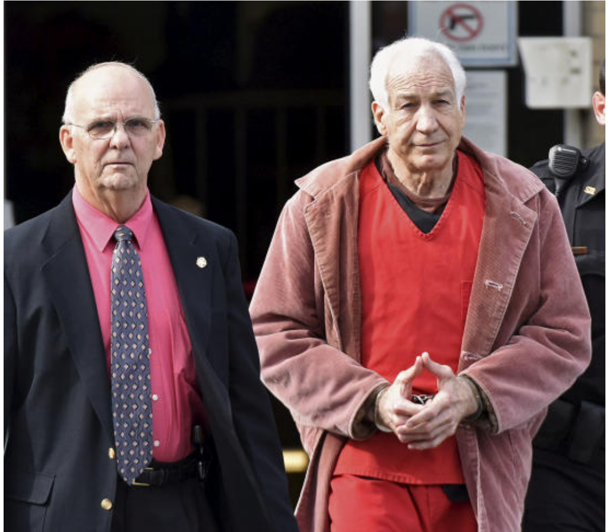
Convicted child molester Jerry Sandusky (centre), a former assistant football coach at Penn State University, is seen during a hearing at the Centre County Courthouse in Bellefonte, Pennsylvania on Oct 29, 2015.

The world of college American football was rocked in 2011 when Penn State University assistant coach Jerry Sandusky was indicted on charges of child molestation.