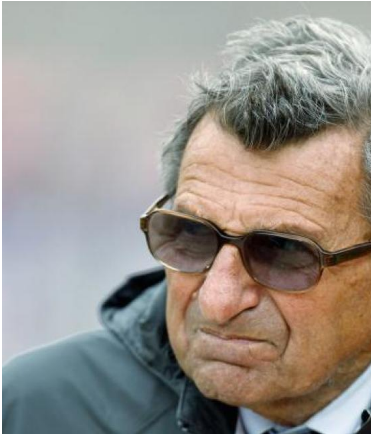
Former Penn State University head coach Joe Paterno watches his team before the start of a game at the University of Illinois in Champaign, Illinois on Oct 3, 2009.

Sandusky was given a 30- to 60-year prison sentence after being convicted of 45 counts of abuse relating to 10 boys.