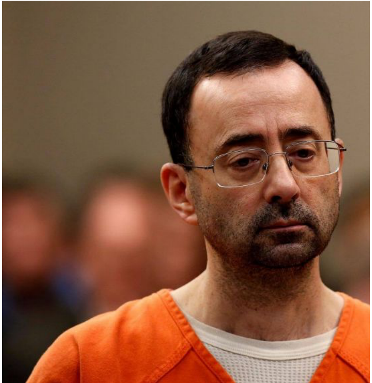
Former Michigan State University and USA Gymnastics doctor Larry Nassar appearing at I on Nov 22.